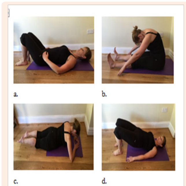
Figure 1: Pilates Intervention a. LSN, b. spine stretch forward, c. diamond press, d. shoulder bridge.

in LF, VAS, CE and ODQ after the 6-week Pilates intervention. Analyses of data were performed using the statistical software SPSS 22 for Windows (SPSS Inc, Chicago IL, USA). A statistical significance value of P < 0.05 was accepted.